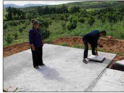
The completed farm reservoir system

The remote farm reservoir is in place and will fulfill the irrigation needs of an entire remote farm and orphanage. We will report the progress of this project .