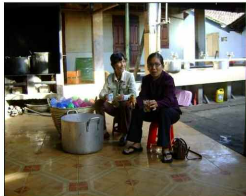
Come join our family !