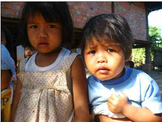
Remember why we are there helping !