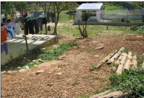
The present failing drain field at VS 1

This year we look to tackle some big projects. We hope to replace the antiquated septic system at VS1 with a modern filtering drain field system.