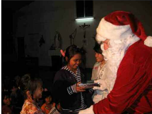
Santa makes dreams and smiles easy !